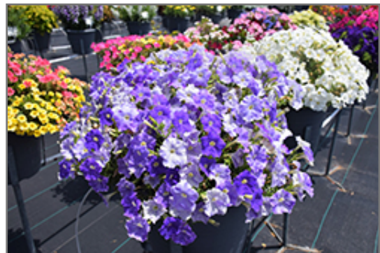
FlashForward Sky Blue Petunia in bloom