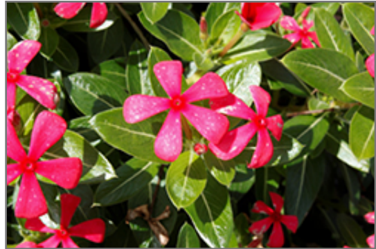
Soiree Kawaii Red Shades Vinca flowers

Soiree Kawaii Red Shades Vinca is recommended for the following landscape applications;