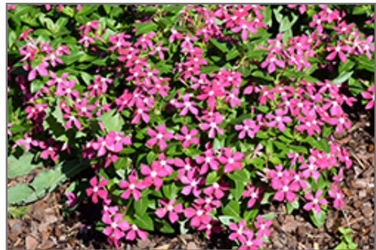
Soiree Kawaii Red Vinca in bloom