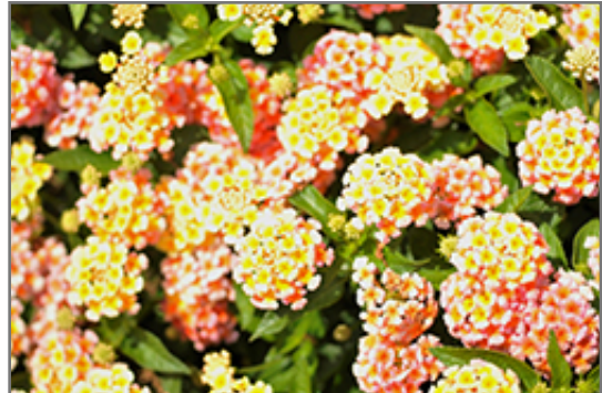
Lucky Peach Lantana flowers