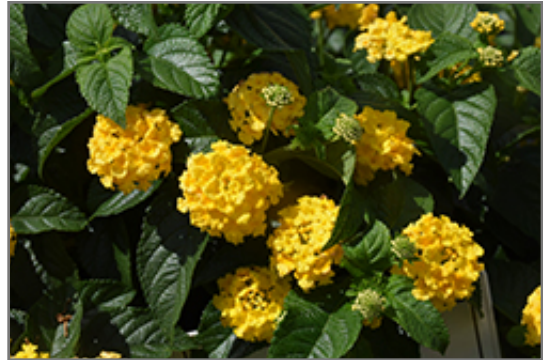
Lucky Yellow Lantana flowers