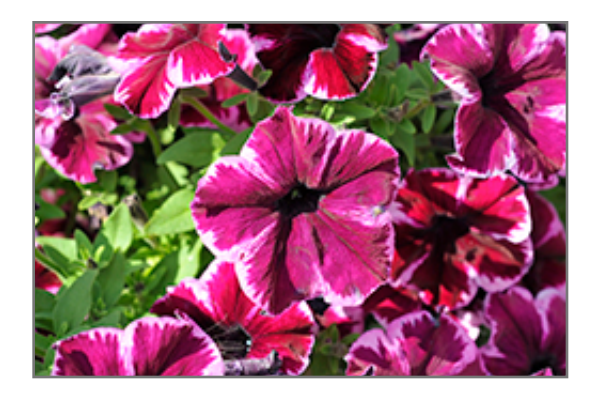
Crazytunia Cosmic Pink Petunia flowers