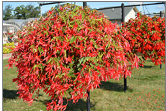
Bossa Nova Rose Begonia flowers