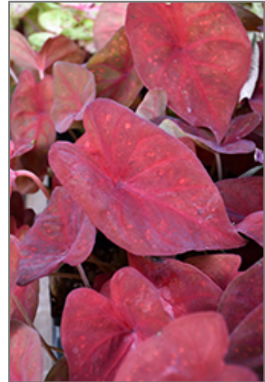
Burning Heart Caladium foliage