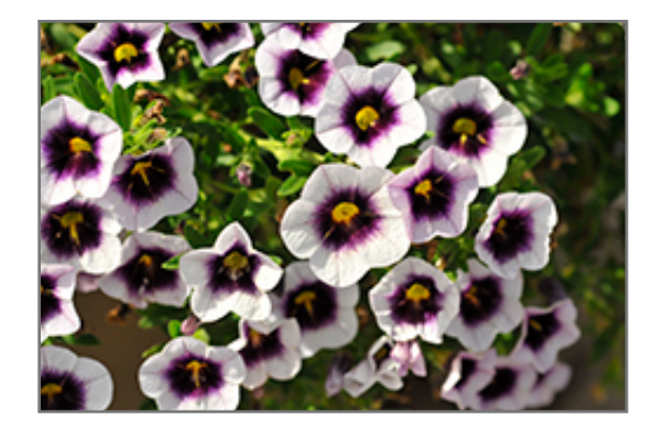
Calitastic Aubergine Star Calibrachoa flowers