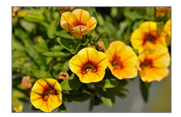
Colibri Mellow Yellow Calibrachoa flowers