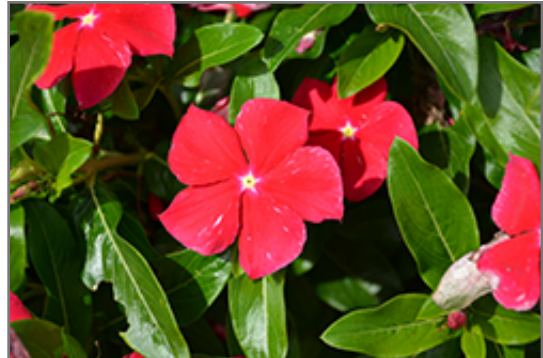
Cora XDR Red Vinca flowers