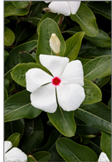
Cora Cascade Polka Dot Vinca flowers