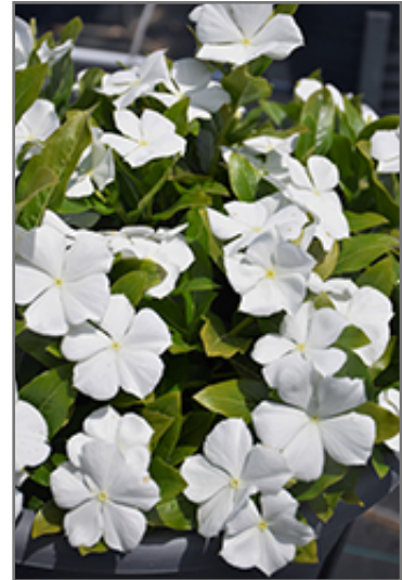
Cora Cascade White Vinca flowers