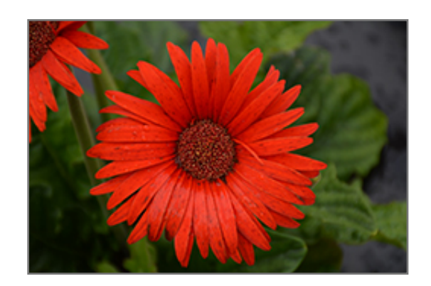
Majorette Blazing Eyes Gerbera Daisy flowers