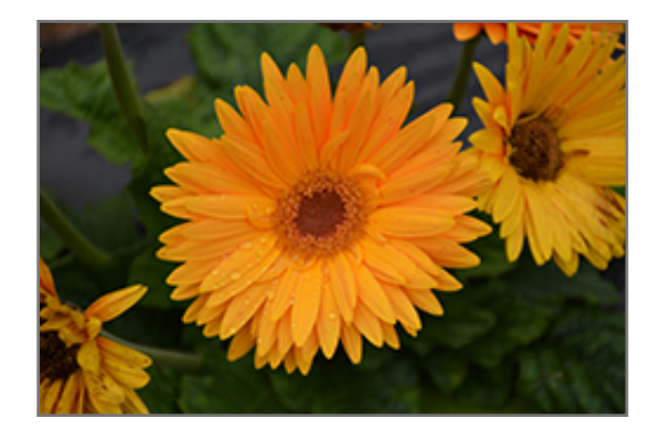
Majorette Blazing Eyes Gerbera Daisy flowers