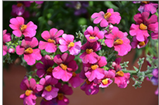
Nessie Plus Purple Nemesia flowers