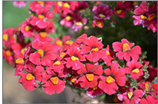
Nessie Plus Red Nemesia flowers