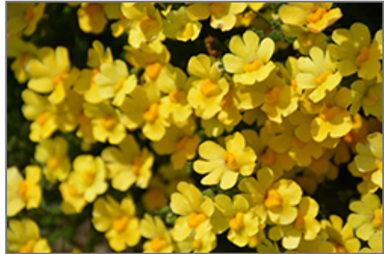
Nessie Plus Yellow Nemesia flowers