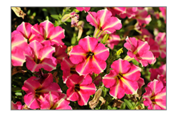
Crazytunia Amarena Cream Petunia flowers