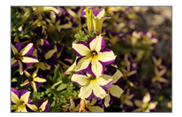
Crazytunia Frisky Violet Petunia flowers