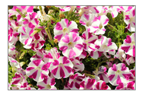
Crazytunia Pinkadelic Petunia flowers