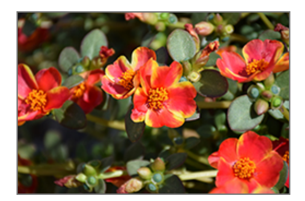
Campino Twist Red Portulaca flowers