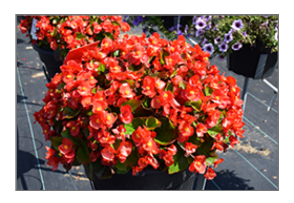
Super Cool Red Begonia in bloom

Super Cool Red Begonia is recommended for the following landscape applications;