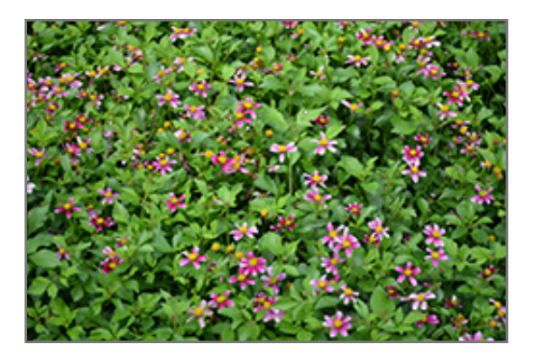
Cupcake Strawberry Bidens in bloom