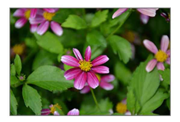
Cupcake Strawberry Bidens flowers

17999 WCR 4 Brighton, CO, 80603 phone: 303-775-9629 www.incolorme.com