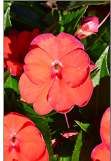
SunStanding Orange Aurora Impatiens flowers