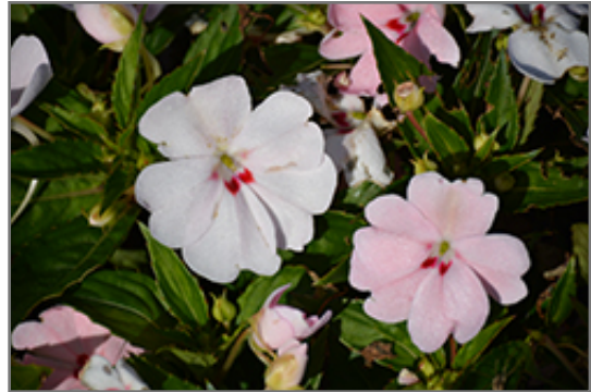
SunStanding Spot On Pink Blush Impatiens flowers