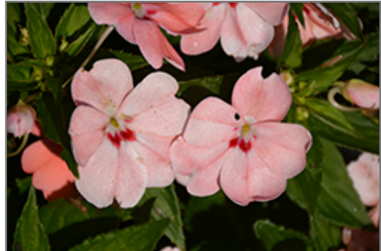
SunStanding Spot On Salmon Impatiens flowers