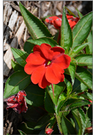
SunStanding Fire Red Impatiens flowers