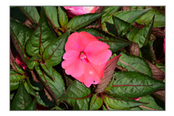
SunStanding Neon Rose Impatiens flowers