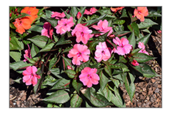
SunStanding Neon Rose Impatiens flowers

17999 WCR 4 Brighton, CO, 80603 phone: 303-775-9629 www.incolorme.com