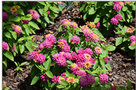
Gem Compact Pink Opal Lantana flowers