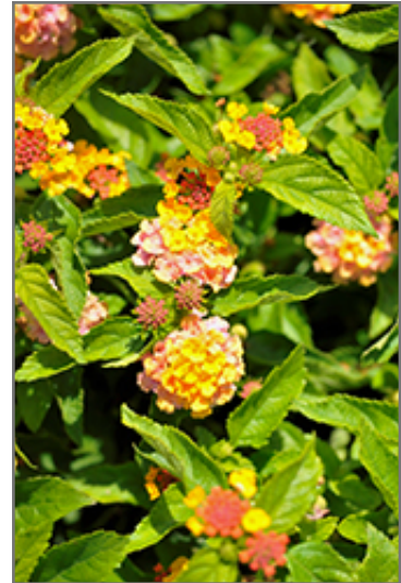
Gem Compact Rose Quartz Lantana flowers