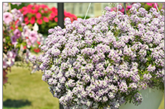
Lucia Lavender Sweet Alyssum in bloom