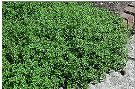
Spanish Thyme