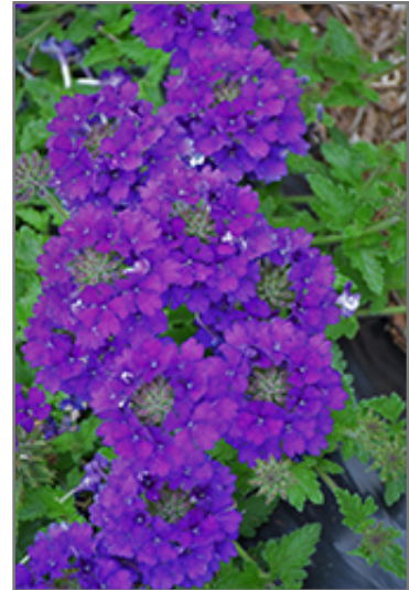
Samira Deep Blue Verbena flowers