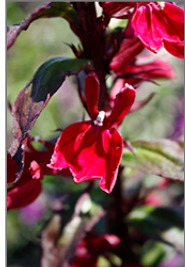
Starship Burgundy Lobelia flowers