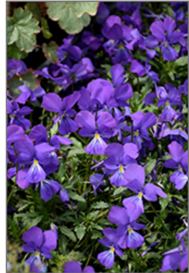
Corsican Pansy flowers

Corsican Pansy is recommended for the following landscape applications;