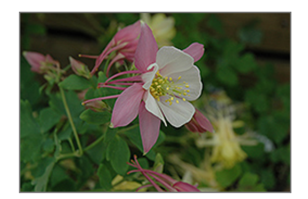
Origami Pink and White Columbine flowers