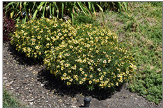
Sizzle And Spice Sassy Saffron Tickseed in bloom