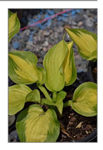
Lakeside Banana Bay Hosta foliage