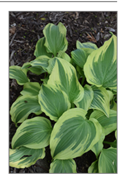
Lakeside Kaleidoscope Hosta