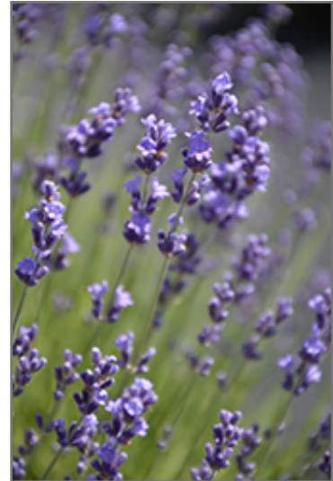
Fashionably Late Lavender flowers