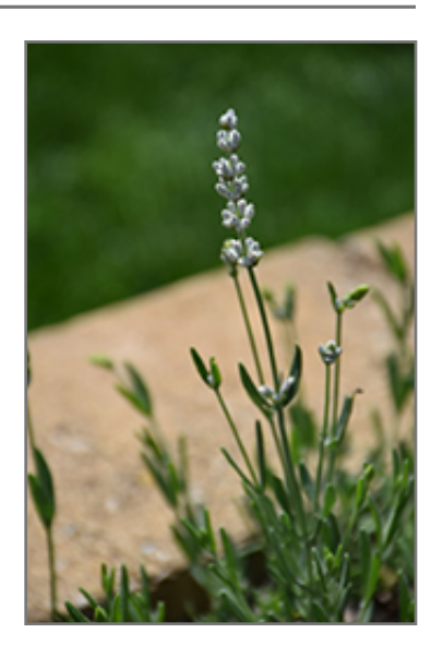
Sentivia Silver Lavender flowers