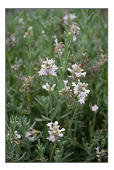
Sentivia Silver Lavender flowers