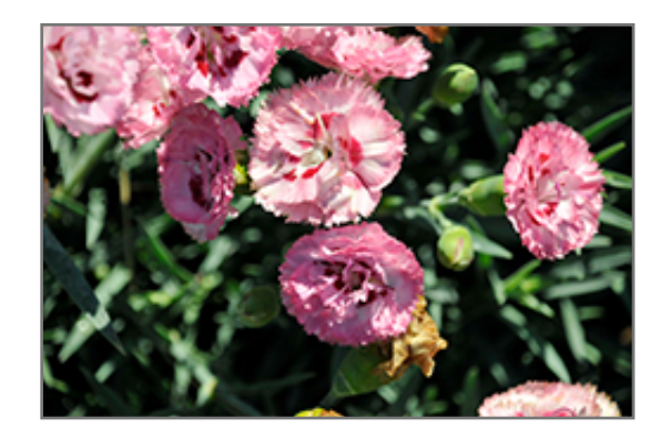
Pretty Poppers Appleblossom Burst Pinks flowers