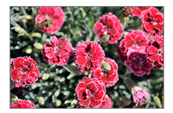
Fruit Punch Black Cherry Frost Pinks flowers