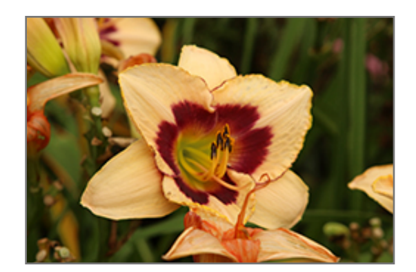
Blueberry Candy Daylily flowers