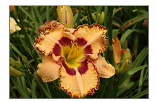
Rainbow Rhythm Lake of Fire Daylily flowers