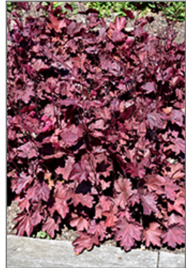
Carnival Burgundy Blast Coral Bells