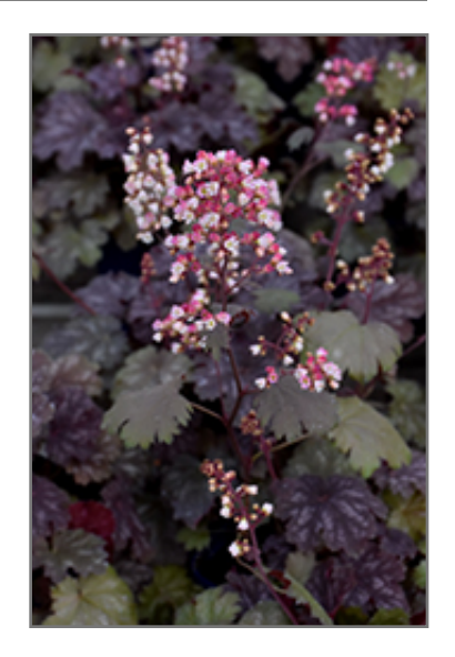
Baby Bells Cinnamon Glaze Coral Bells flowers