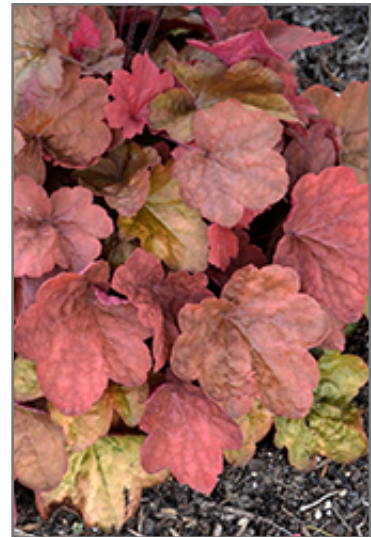
Carnival Cinnamon Stick Coral Bells foliage