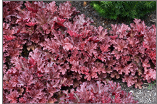
Ruby Tuesday Coral Bells

Ruby Tuesday Coral Bells is recommended for the following landscape applications;