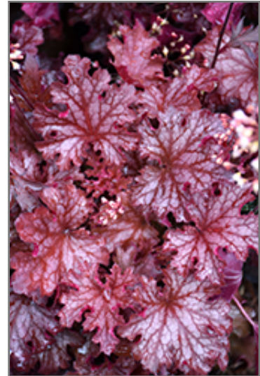
Ruby Tuesday Coral Bells foliage

Ruby Tuesday Coral Bells will grow to be about 9 inches tall at maturity extending to 16 inches tall with the flowers, with a spread of 14 inches. When grown in masses or used as a bedding plant, individual plants should be spaced approximately 12 inches apart. Its foliage tends to remain low and dense right to the ground. It grows at a medium rate, and under ideal conditions can be expected to live for approximately 10 years. As an evergreen perennial, this plant will typically keep its form and foliage year-round.