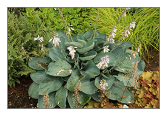
Shadowland Above The Clouds Hosta in bloom